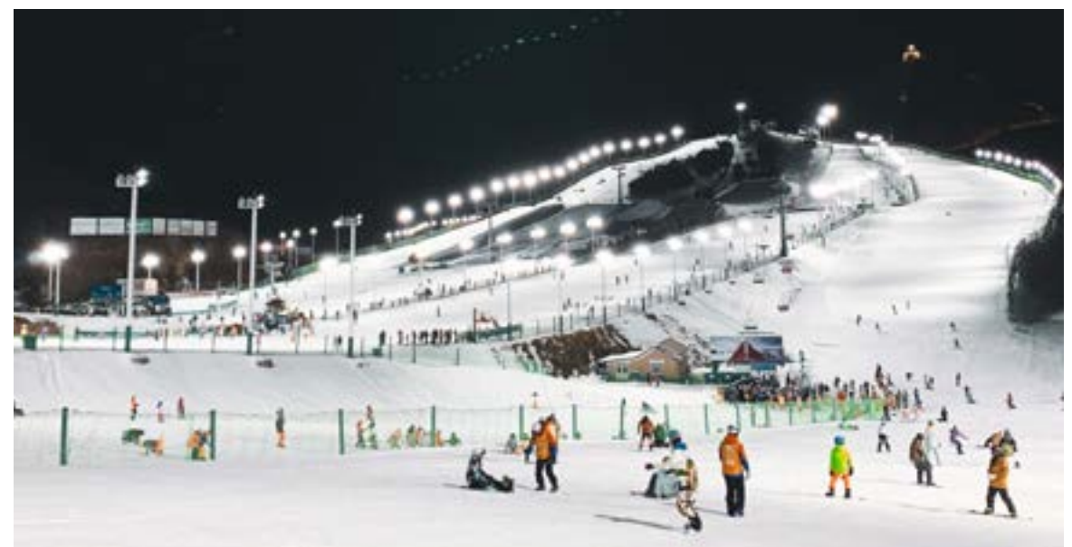
Skiing (Dec - March) 360 CNY / student