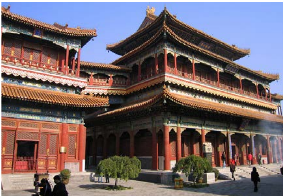
Lama Temple FREE