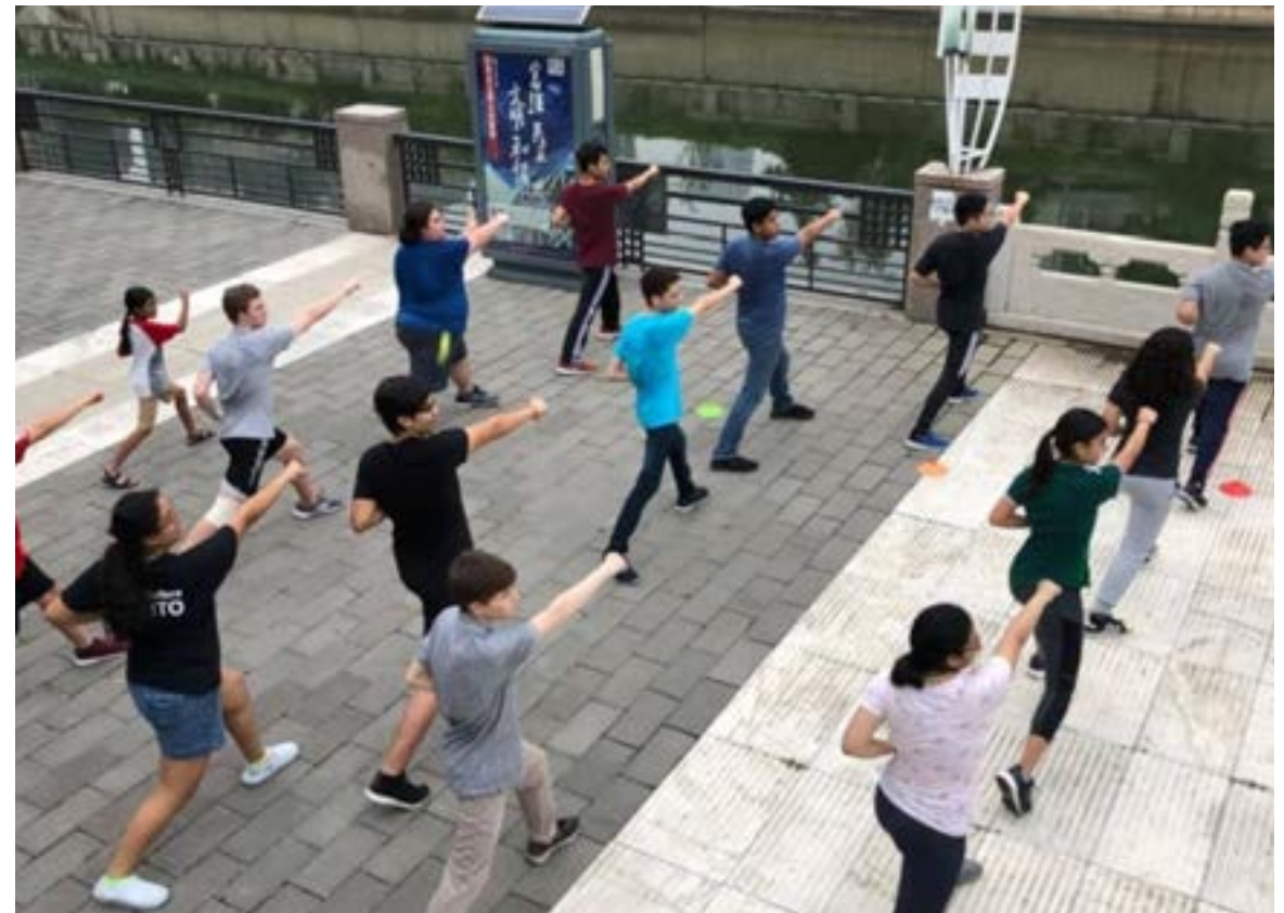
Kung Fu Class 333 CNY / 10 students