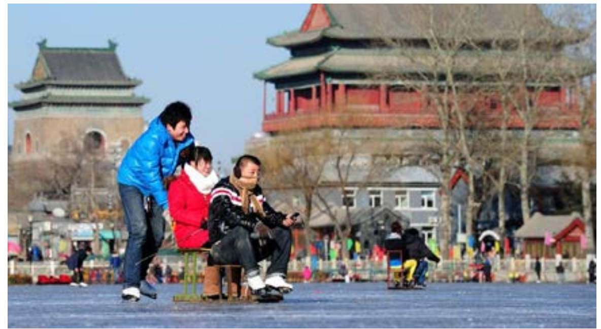
Houhai Ice Skating (Dec - March) 280 CNY / student