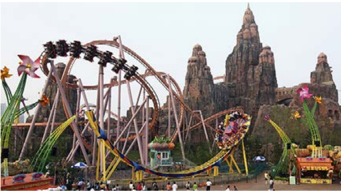
Happy Valley (March - Nov) 440 CNY / student

It is possible to add additional activities on Sundays at an extra charge or change activities during the week, some at no cost while some have additional charges.