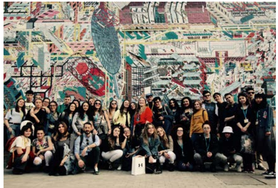
798 Art District FREE