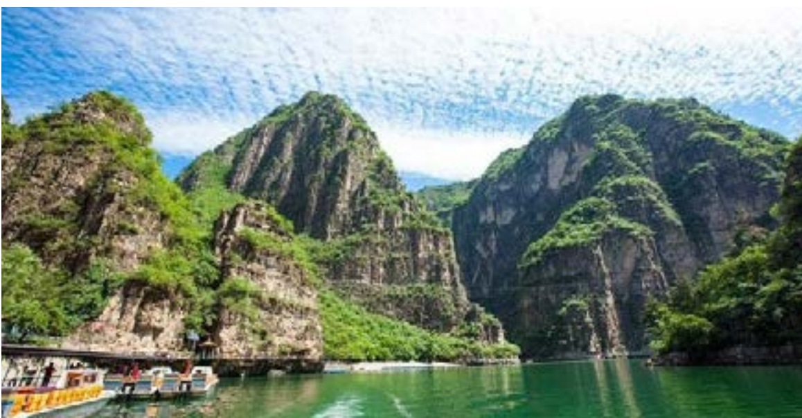
Longqing Gorge (May - Sep) 470 CNY / student