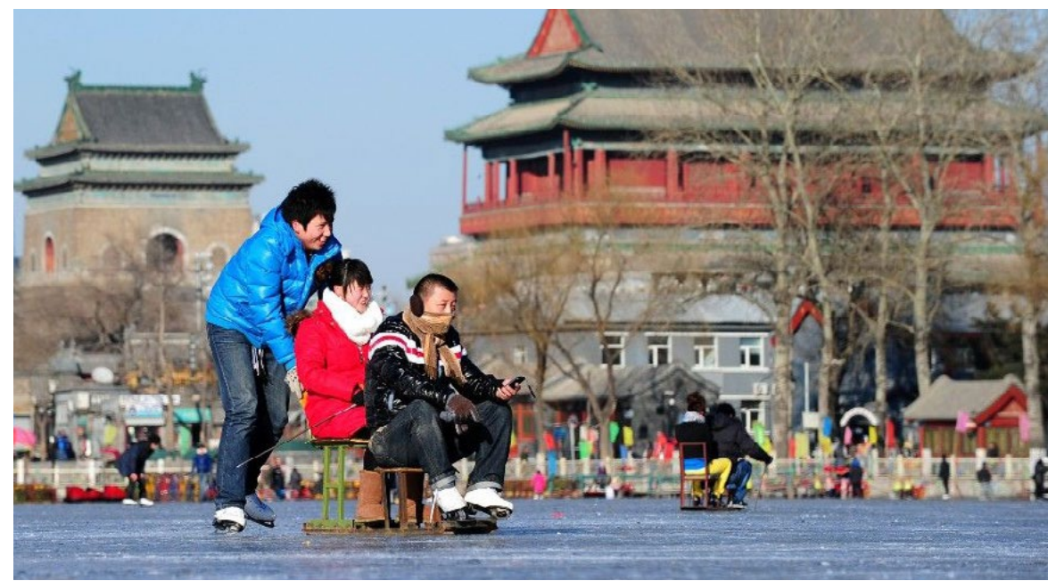
Houhai Ice Skating (Dec - March)