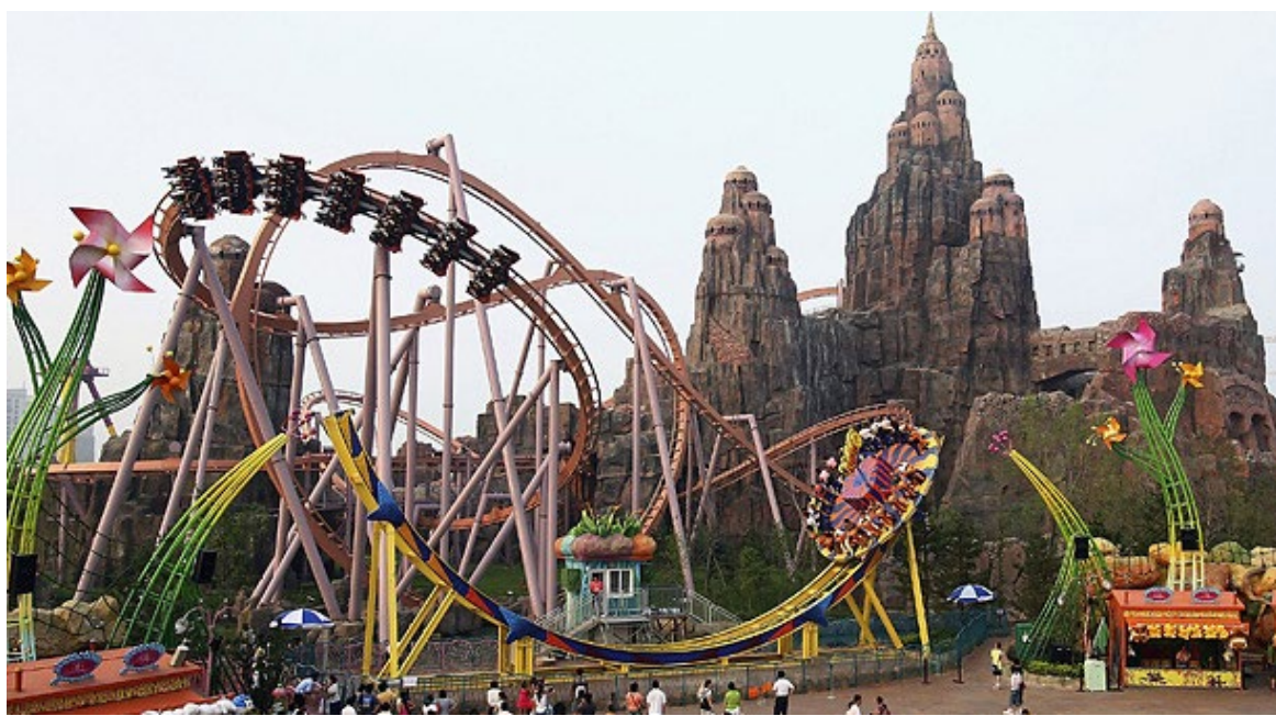
Happy Valley (March - Nov)

It is possible to add additional activities on Sundays at an extra charge or change activities during the week, some at no cost while some have additional charges.