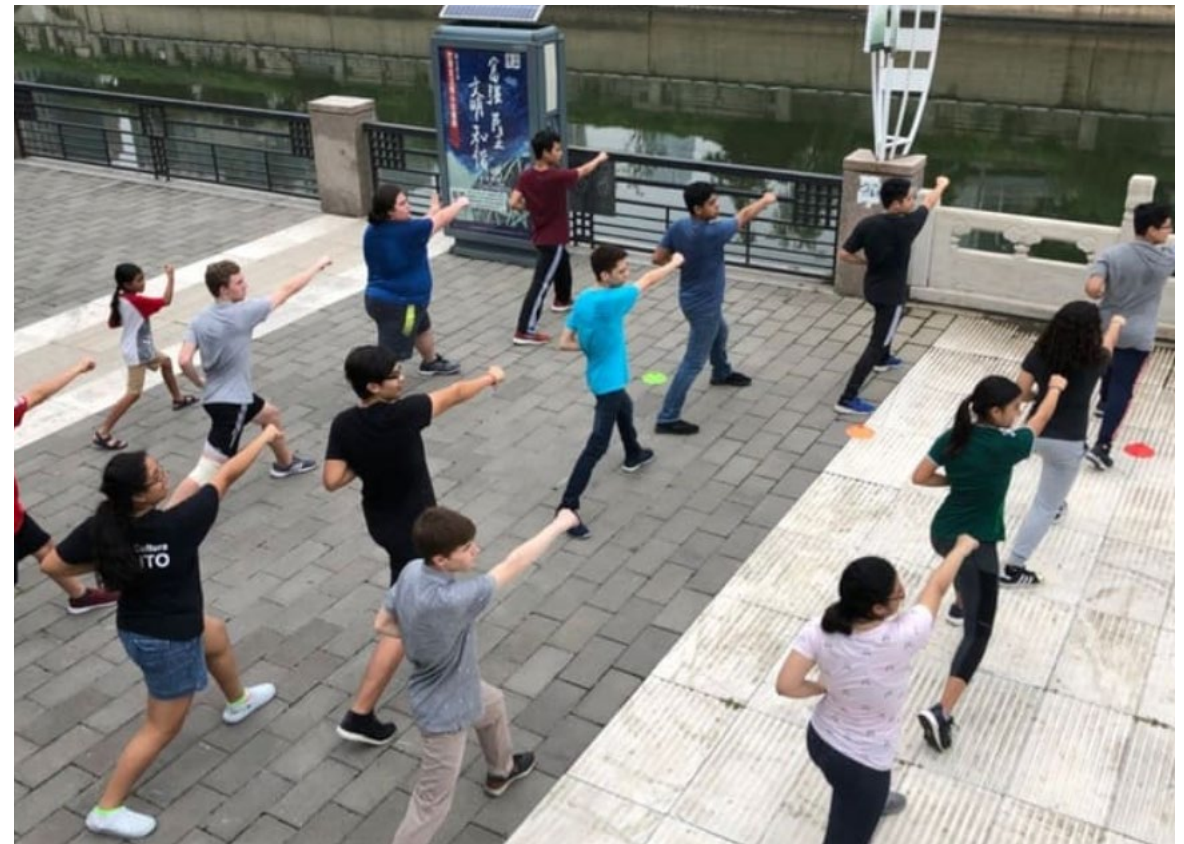
Kung Fu Class