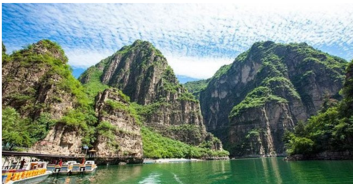
Longqing Gorge (May - Sep)